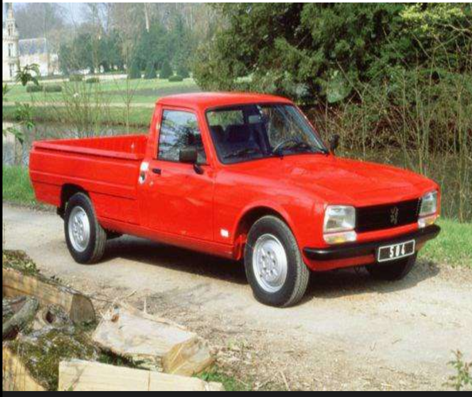
Peugeot Original Pickup

A: Yes all our Hardtops are painted to match Factory Colour Codes