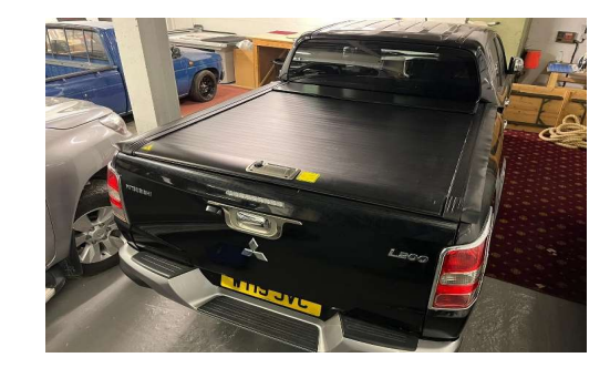
Pull the roller top back and ensure clearance with the tailgate. Then tighten side arms brackets.