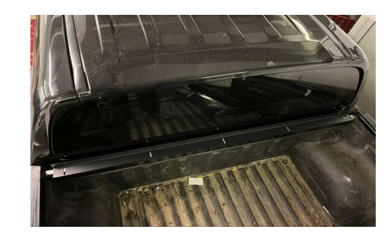
Fit the bulkhead bracket with the self tapping bolts supplied.

Position the black right angle bracket evenly between the bulkhead. Fix with self tapping bolts supplied. This bar may need to be adjusted forwards or backwards once the roller top is lifted into place.