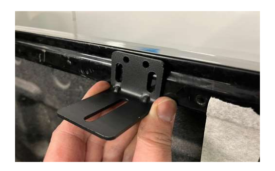
Fix the side brackets (measuring from the bulkhead) between 36-133 cm. These may need adjusting in height once the roller top is sat on the pick up tub.

Position the black right angle bracket evenly between the bulkhead. Fix with self tapping bolts supplied. This bar may need to be adjusted forwards or backwards once the roller top is lifted into place.