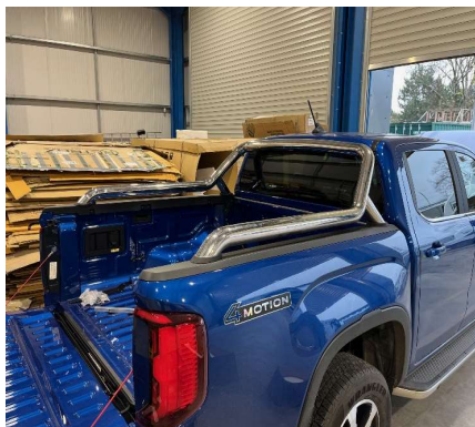
1. Remove Roll Bar