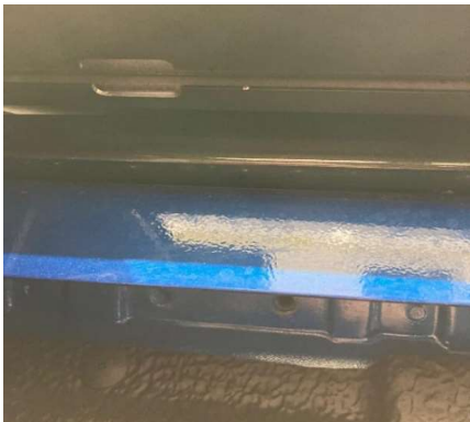
12. Slide the T-bolts into place