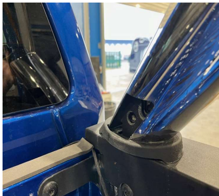
2. Remove the plastic cover and remove bolts