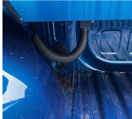
13. Fit the drainage front and rear