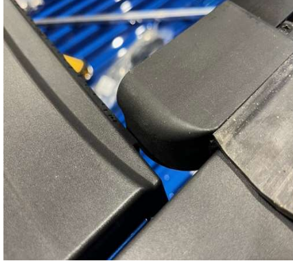
9. Close the tailgate to line up the roller top