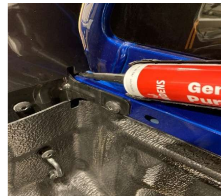
4. Assemble the Roller top, ensure joints between the bulkhead and side arms are sealed