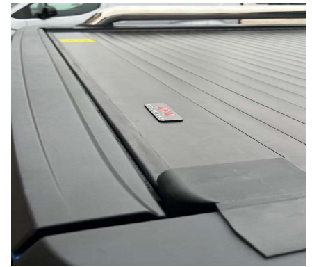
14. Ensure the roller top closes against the tailgate