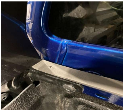
5. Attach the bulkhead seal