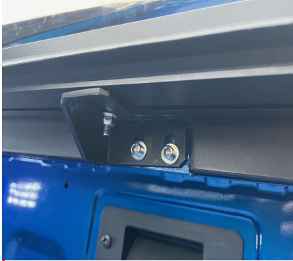
8. Fit the middle brackets