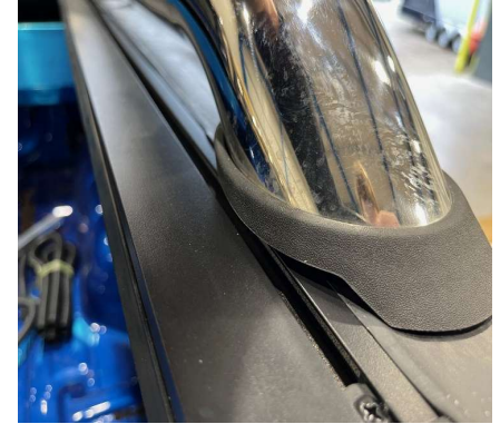
11. Ensure the side rubber sits inbetween the top of the bed rail and sports bar