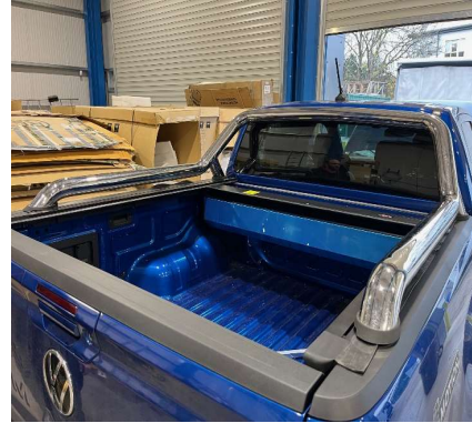
10. Lift the assembled roller top into the bed (Don't fit the bulkhead bar). Lift the sports bar in place