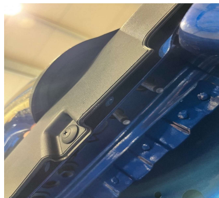
3. Remove 2 nuts from the rear legs