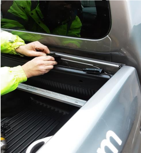
1) If fitted with a bed liner, remove the front C-Channel. Remove the blanking plugs (in the Navara) to reveal the pre-threaded holes. Loosely fit the four brackets.