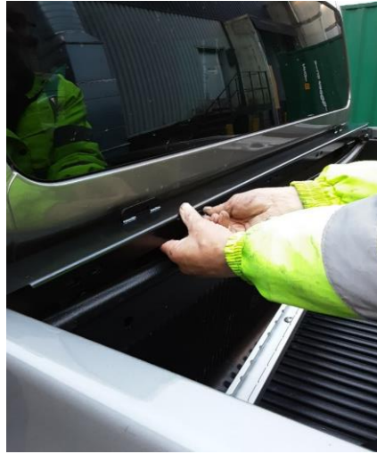
2) Lift the bulkhead bar into place and loosely fit the bolts into the previous brackets