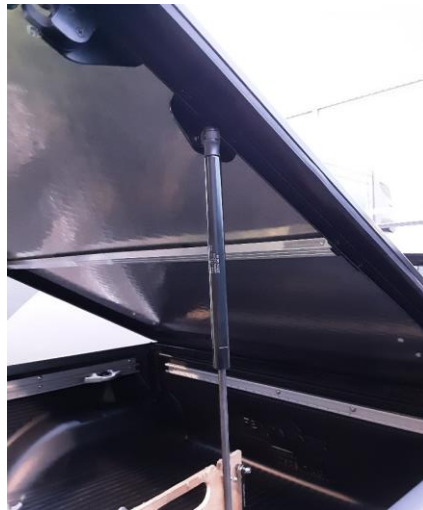
6) Attach the gas struts to the lid