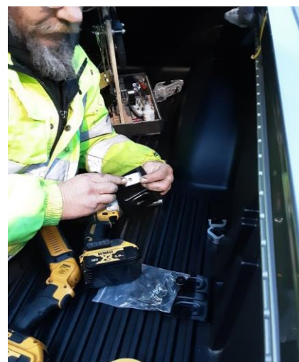
7) Assemble the gas strut brackets and catches and loosely fit to the Navara.