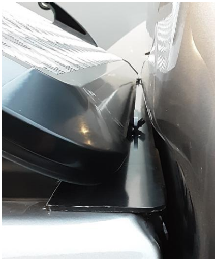
5) With two people, lift the lid 90 degrees and slot the lid into the bulkhead bar.