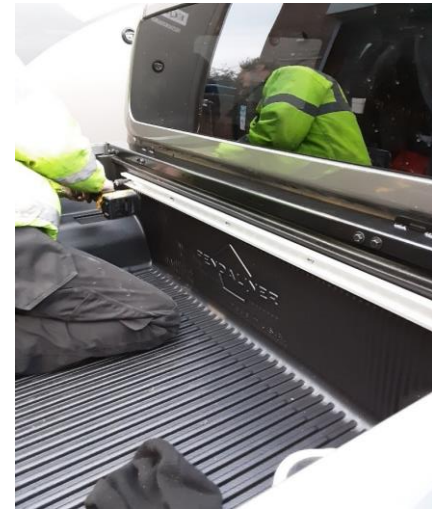
4) Refit C-Channel if removed