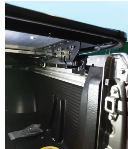
8) Offer the lid down to the catches, realign and tighten. There is additional adjustment within catches at the lid end if needed. Use the Gas struts to measure the position required for the brackets (approx. 40 mm after the strut cylinder) tighten and fit the struts